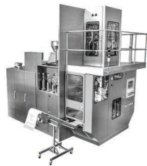
Rommelag® Bottelpack 460