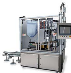
Weiler ASEP-TECH® Lab+