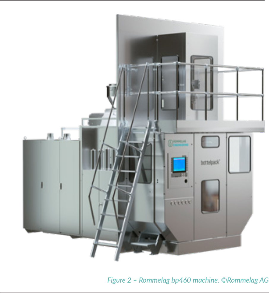
Figure 2 – Rommelag bp460 machine. ©Rommelag AG

ApiJect met the HHS/DOD timetable for Project Jumpstart. The first BFS line became operational on October 30, 2020, less than seven months since the project launch. The second BFS line became operational a month later and pharmaceutical partners began engaging with ApiJect about using this fill-finish capacity.